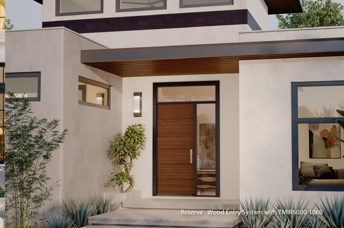
Reserve™ Wood Entry System with TMIR6000-106B