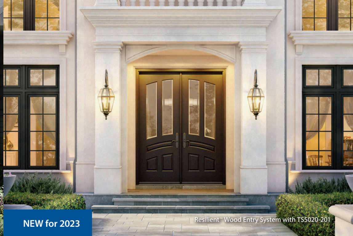
NEW for 2023