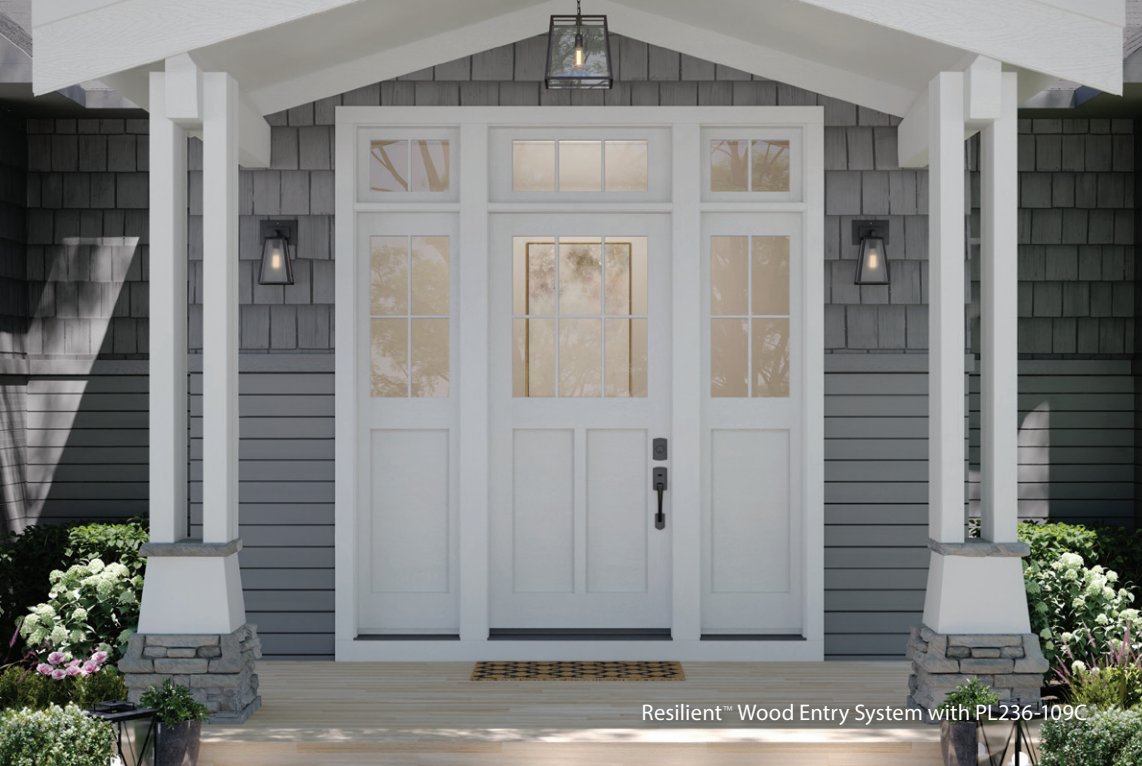
Resilient™ Wood Entry System with PL236-109C